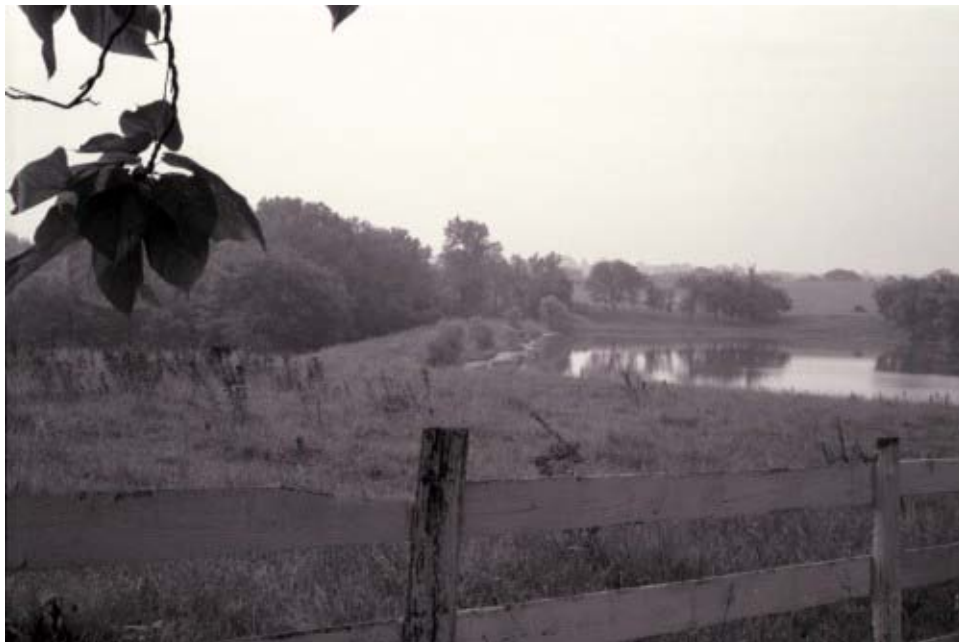
Stabilization ponds need to be carefully sited to not discourage adjacent development.