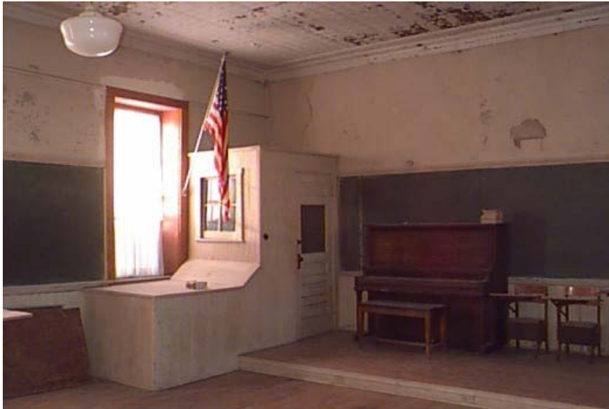
Historic structures, such as the one room Buck Creek School shown above, are being restored.