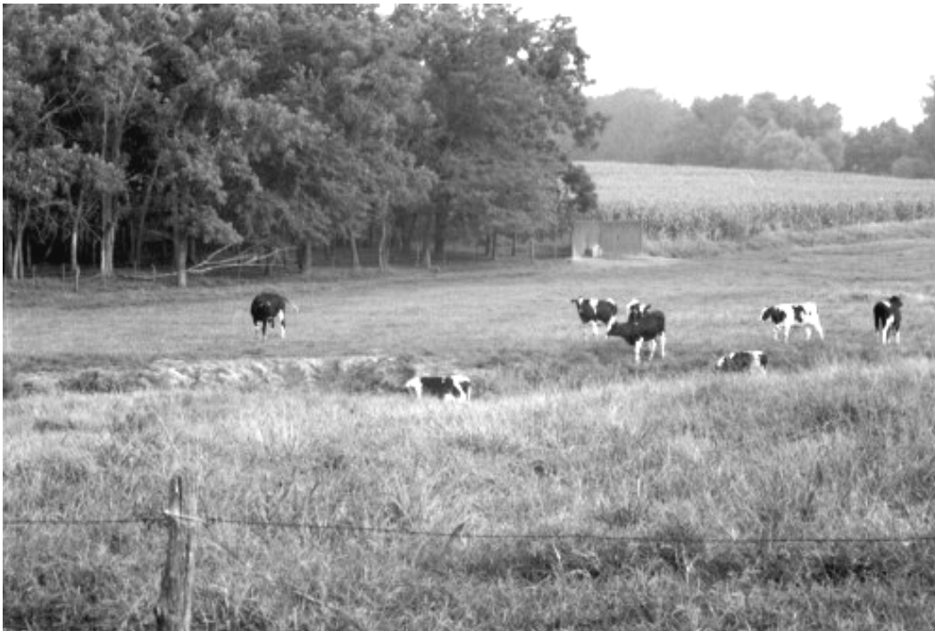
A small dairy farmer raises corn to feed the cows, who graze on pasture and create fertilizer, which in turn is spread on the tilled corn fields.

As development has pushed outward beyond the traditional bounds of regional centers, suburban communities and small rural towns, a new tier of fast growing "rural fringe" development - outside of established communities, located farther from regional centers - has grown at high rates. With this trend can come an increasing level of economic distress. Also, local zoning typically does not limit the number of curb cuts along country roads. It is not uncommon in many communities to have many curb cuts along a country road. Traffic danger of limited sight-distance must be considered. In Jefferson County, the County Engineer's office reviews proposed access to county roads in a case by case basis.